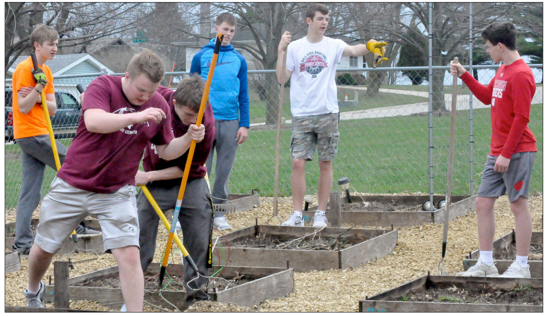
Members of the Grundy Center High School Track Team met up for a service day at the GC Community Garden last Wednesday, where they hauled over 60,000 pounds of rock into the pathways of the garden.