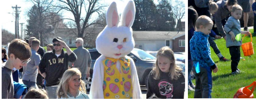
Capacity crowds turned out for the Easter Egg hunts in Grundy Center, Dike, Reinbeck and Holland on Saturday morning, and a few photos from the scene are shown above. View more inside and at our website.