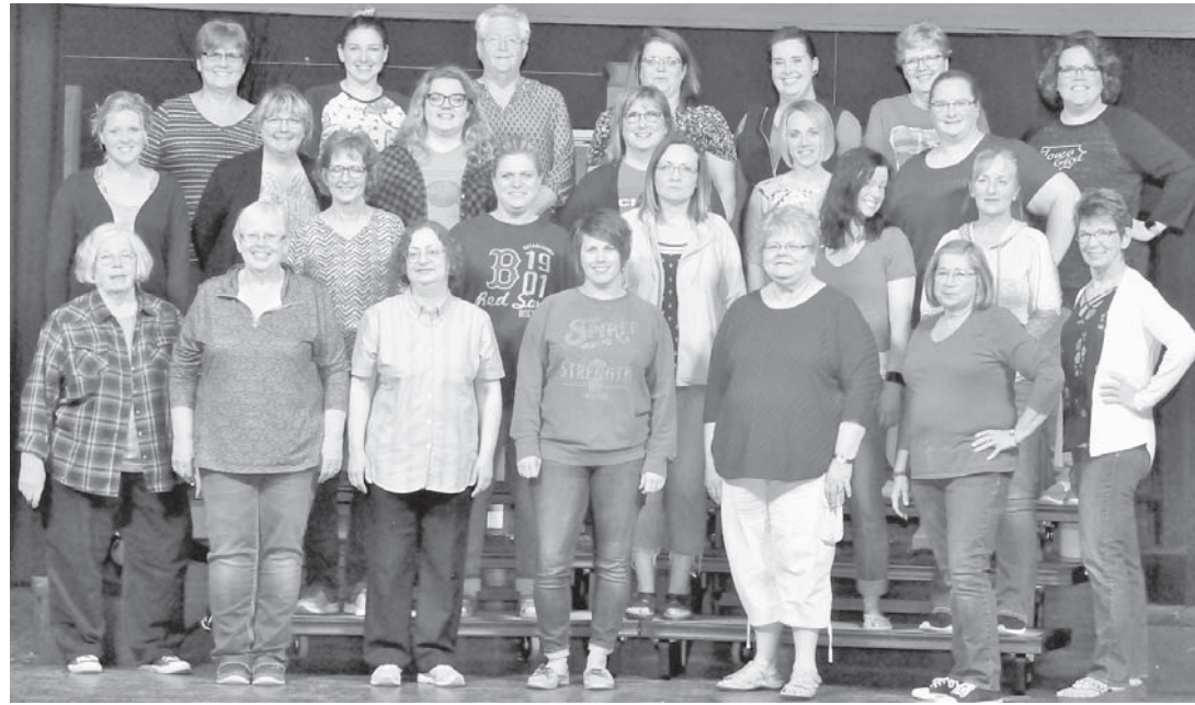
Members of the Tuesday Music Club pose for a photo at the BCLUW High School auditorium in Conrad last week. The group will perform on Friday night at 7:30 p.m. and Sunday afternoon at 2:00 p.m.