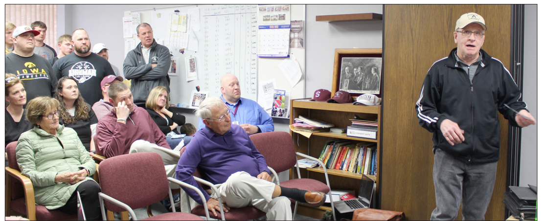
Dan Gable was one of the many visitors at last week's Grundy Center School Board meeting, where a group of students, parents and community members made a case for why Grundy Center should have its own, independent wrestling program.