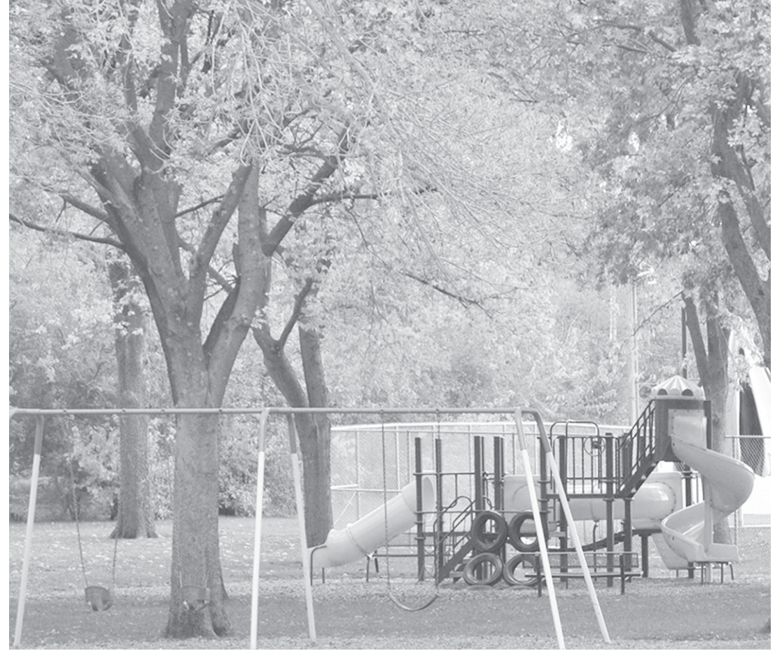
A group of volunteers are currently raising funds to replace the aging playground equipment at Elmwood Park in Reinbeck.

After four decades of county tours around the state, Grassley is traveling with a security detail for the first time as President Pro Tempore of the Senate, and he admitted that it's taken a bit of getting used to. He called it "a little bit of a convenience, but more of a pain in the butt."